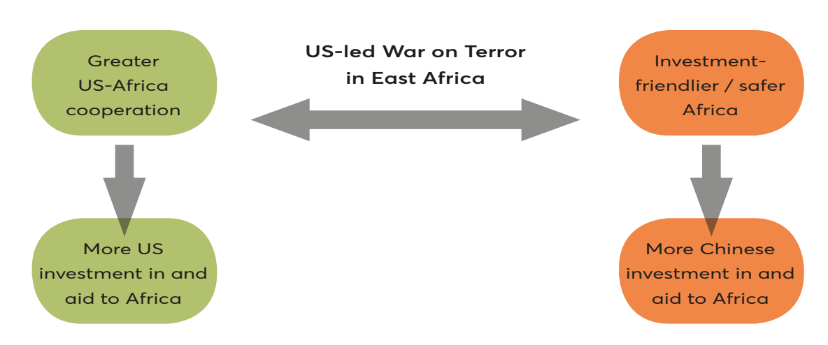
Figure 2: Gains in East Africa resulting from US-led War on Terror